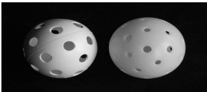
Figure 2-2. The Ball.

The ball pictured on the left of Figure 2-2 is customarily used for indoor play and the ball pictured on the right is customarily used for outdoor play. However, all approved balls are acceptable for indoor or outdoor play. The complete list of approved balls is on the IFP website.